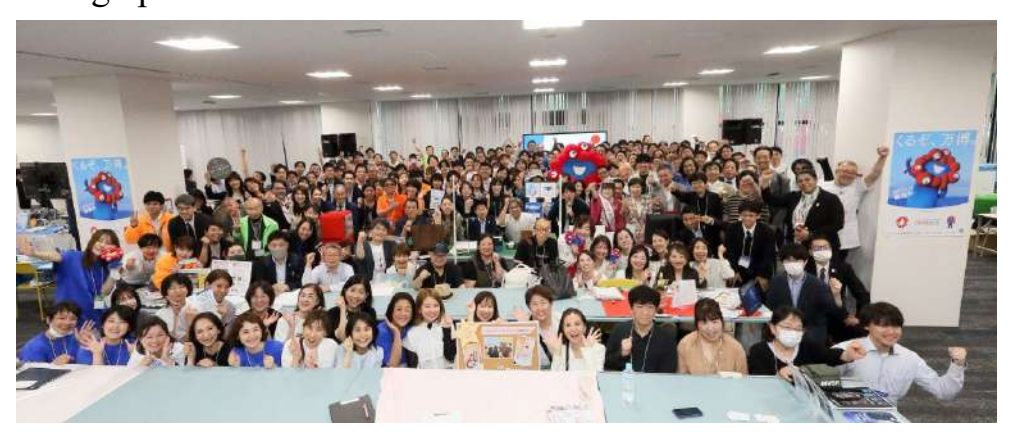
TEAM EXPO 2025 Meeting

- May 28; <u>The 4th TEAM EXPO 2025 Meeting</u> was held in Osaka. Approximately 600 participants, engaged in various TEAM EXPO 2025 voluntary co-creation activities, attended. based on the theme of the Expo attended. Opportunities for networking and mutual learning were provided through presentations and exhibitions at booths.