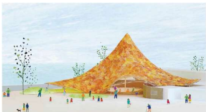
Toilet facility Rest area

https://www.expo2025.or.jp/news/news-20240530-05