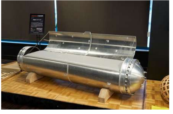
Space Tank Bench using space rocket waste