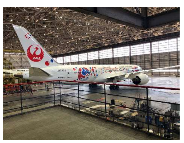
Myaku-Myaku Jet No. 2