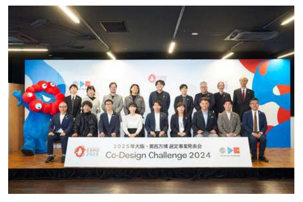
Presentation in Suminoe Ward, Osaka