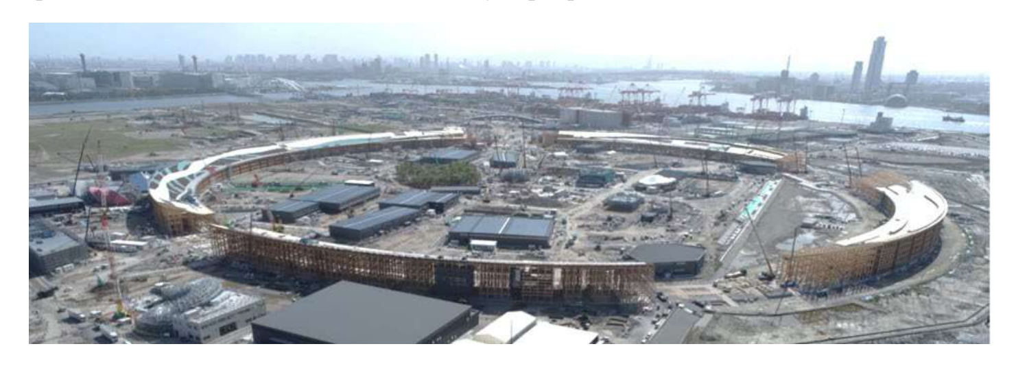
View of the Grand Ring, as of April 19

- June 1; The Association started accepting reservations from the general public for the <u>Expo</u> <u>Construction Tour</u>. Visitors will be able to view the construction scenery from inside and the top of the Grand Ring. As of June 3, all 18 available tour sets have been sold out, but private tours remain available. Fee is 1,000 yen per person.