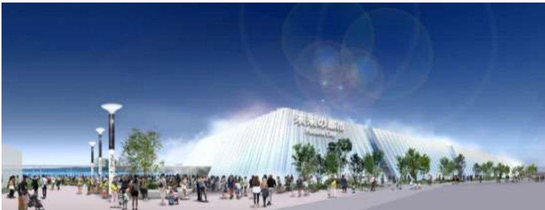
Exterior image of the pavilion