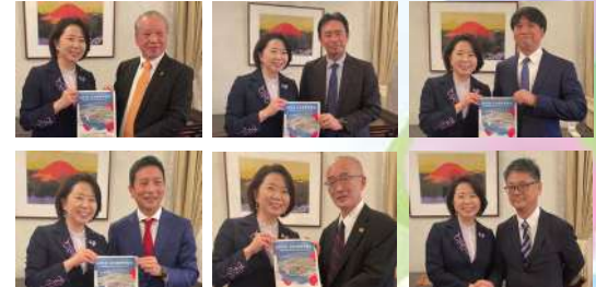
Exchanged views with Hong Kong's travel industry members regarding attracting visitors to the Expo