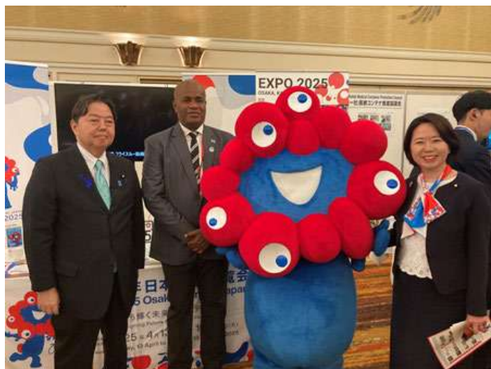
From left to right: Chief Cabinet Secretary Hayashi, Deputy Minister of the Fiji Prime Minister's Office, Myaku-Myaku, Minister of State for the Expo Jimi

(2) July 16; Myaku-Myaku welcomed guests at the 10th Pacific Islands Leaders Meeting (PALM10) held in Tokyo. Chief Cabinet Secretary Hayashi and Minister Jimi were also in attendance.