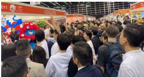
MYAKU-MYAKU cuddly toys were distributed to Expo Quiz participants