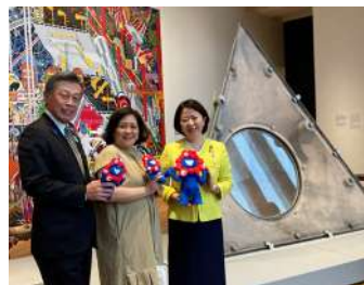
Exhibits from the 1970 Osaka Expo to be preserved in Hong Kong's M+, one of Asia's largest art museums