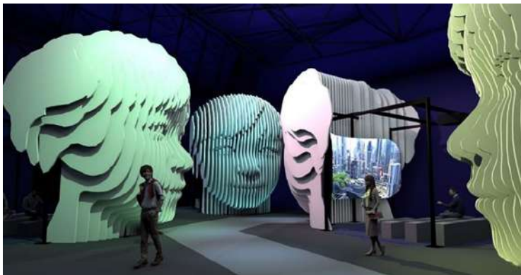
Overall image of Common Exhibiti 02

The exhibit will feature a space for thinking issue in Society 5.0 on the four heads of a robot showcasing virtual experiences of the future if industry and society.