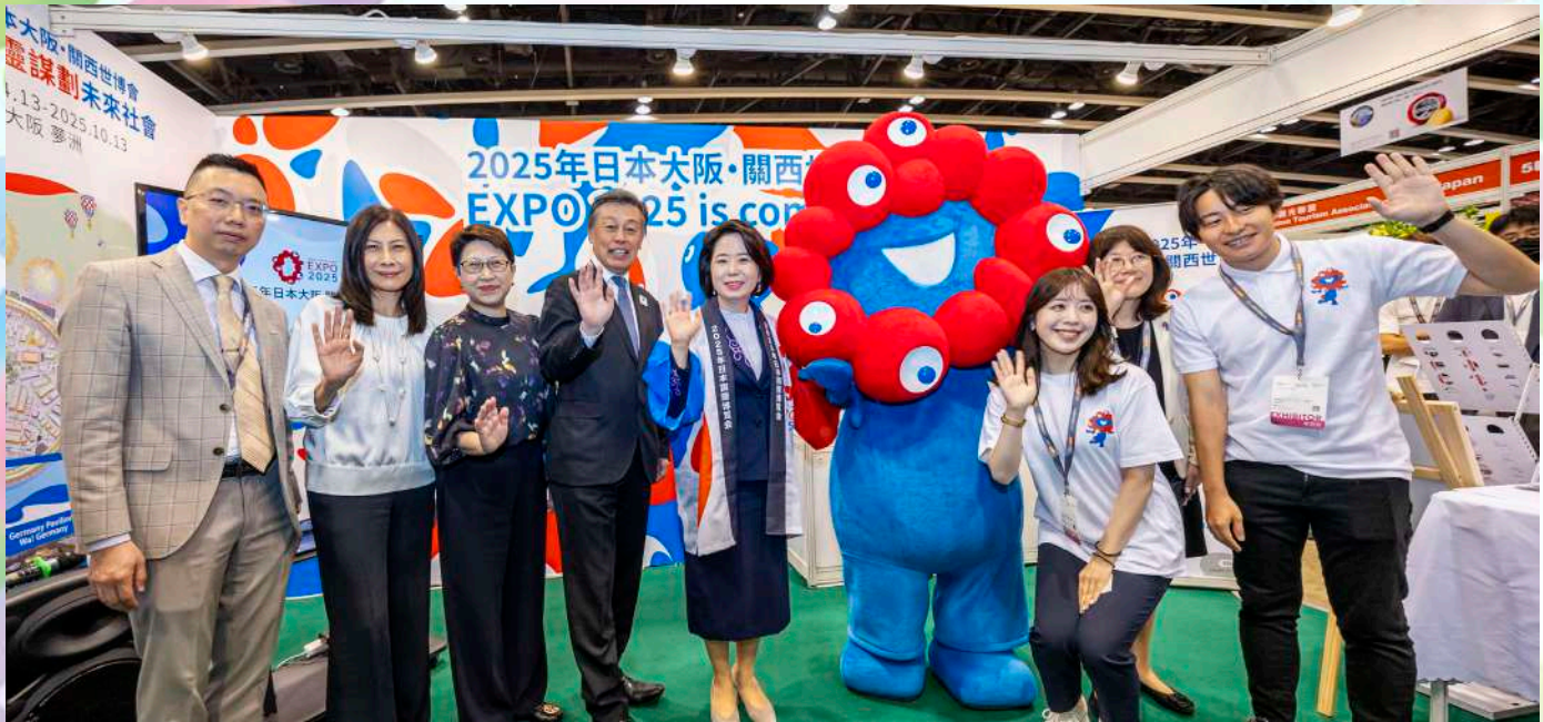
Promoting the Expo at the Hong Kong Book Fair, one of Hong Kong's largest events