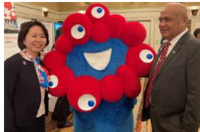
Feleti Penitala TEO, Prime Minister of Tuvalu