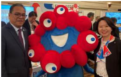
Mr. Wesley W. Simina, President of the Federated States of Micronesia