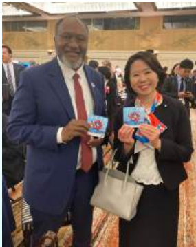
Mr. Charlot SALWAI Tabimamas, Prime Minister of the Republic of Vanuatu