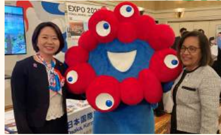
Dr. Hilda C. Heine, President of the Republic of the Marshall Islands