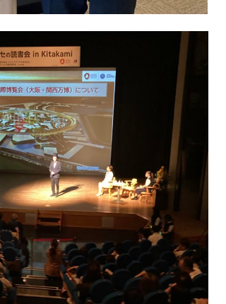
Over 300 parents and kids participated in the "Fukuoka Hakase no Dokushokai in KITAKAMI" reading group Venue: Kitakami, Iwate