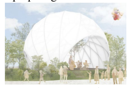
Pop-up Stage North